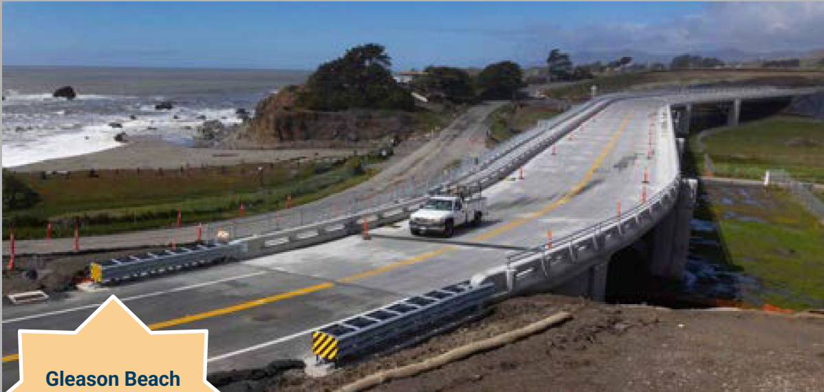
Gleason Beach Highway 1 Realignment Project