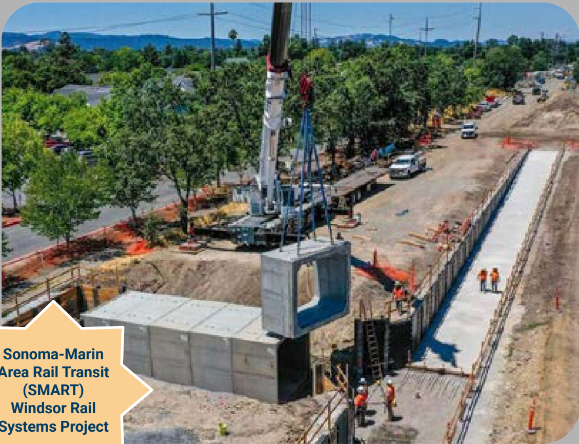
Sonoma-Marin Area Rail Transit (SMART) Windsor Rail Systems Project

75% Regional - Regions 25% Interregional – State