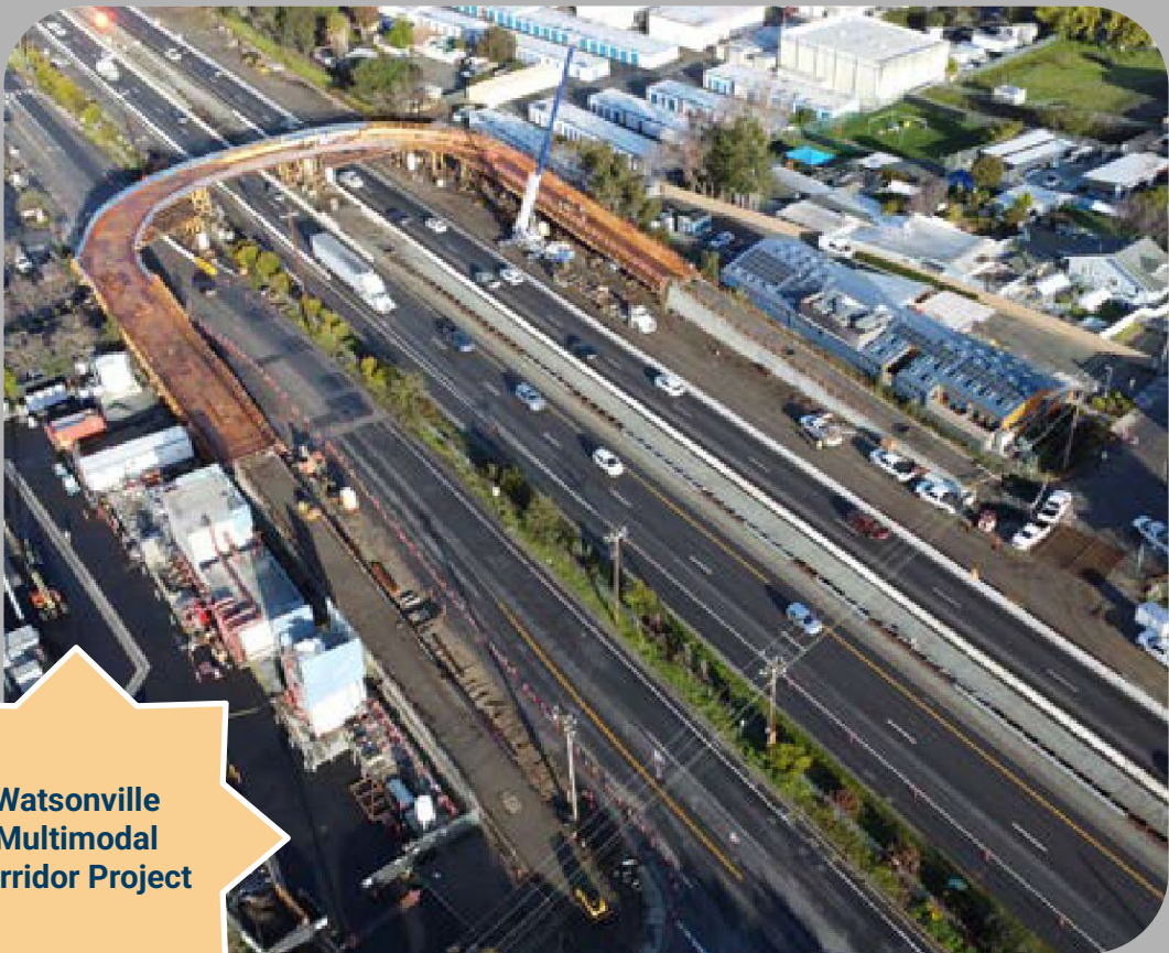
Watsonville Multimodal Corridor Project