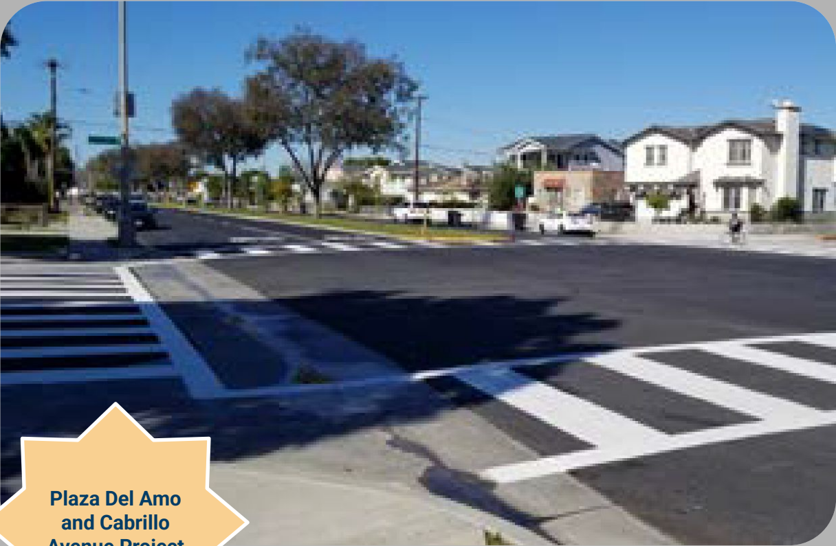
Plaza Del Amo and Cabrillo Avenue Project