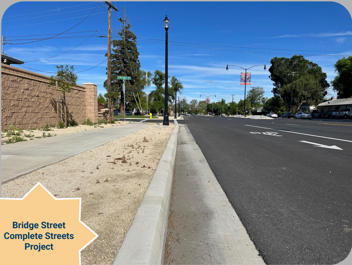
Bridge Street Complete Streets Project